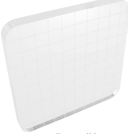
For small items